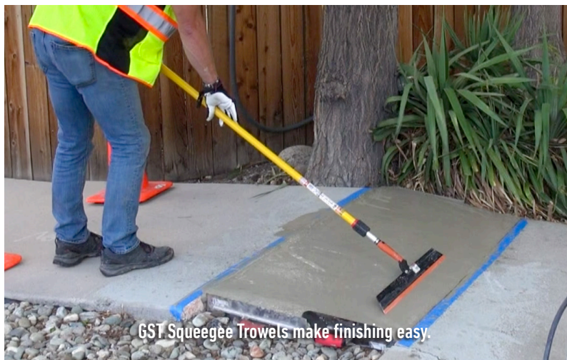
GST Squeegee Trowels make finishing easy.