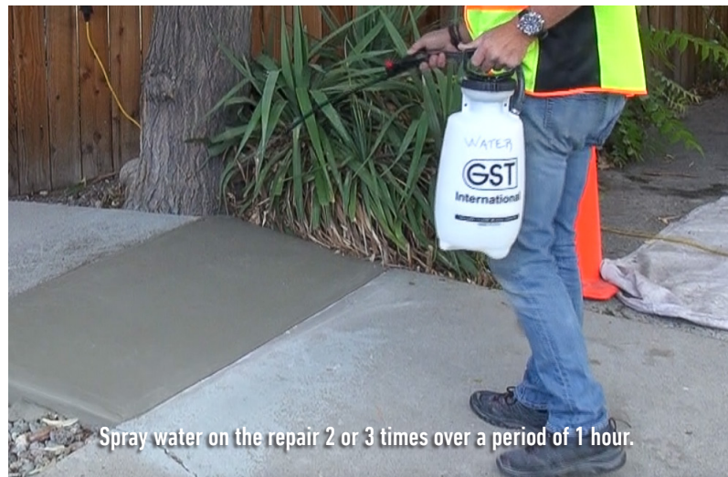
Spray water on the repair 2 or 3 times over a period of 1 hour.