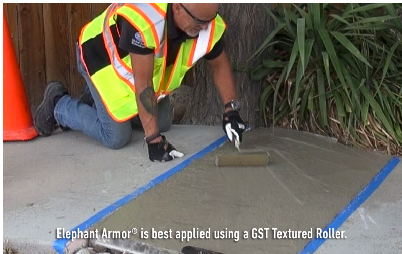
Elephant Armor® is best applied using a GST Textured Roller.