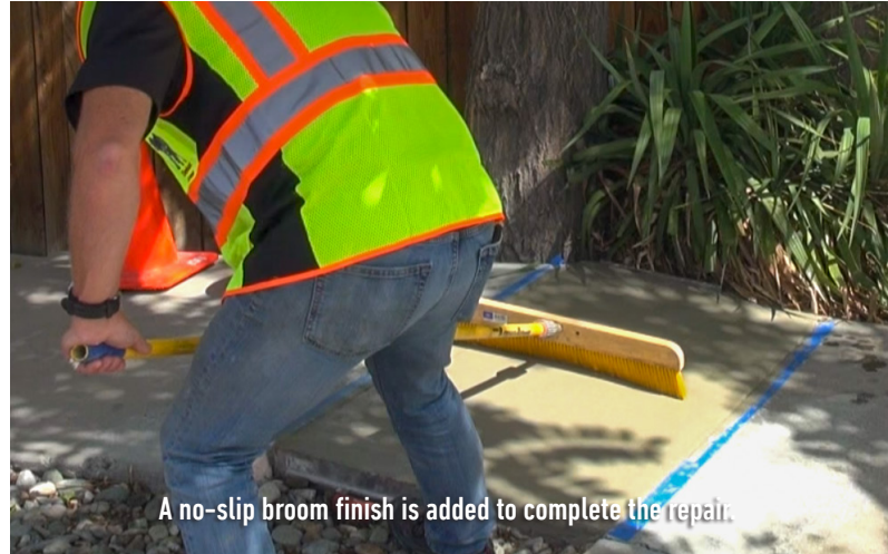
A no-slip broom finish is added to complete the repair.

GST International, Sparks, NV (775) 829-2626